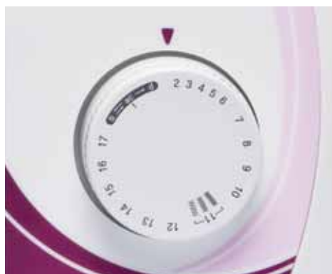
Easy stitch selection dial