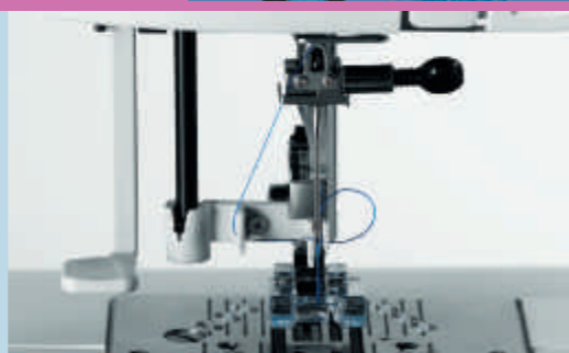
Needle-threader: because fashionistas love technology too.