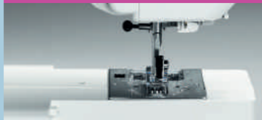
Softly, softly: foot pressure adjustable in 3 positions.