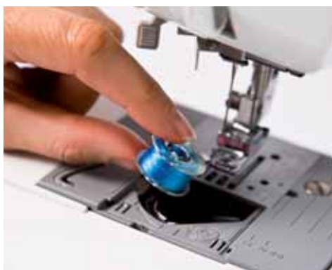
Quick-set bobbin – just drop in a full bobbin and you are ready to sew