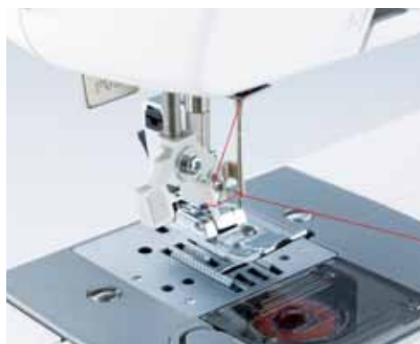
Easy automatic needle threading